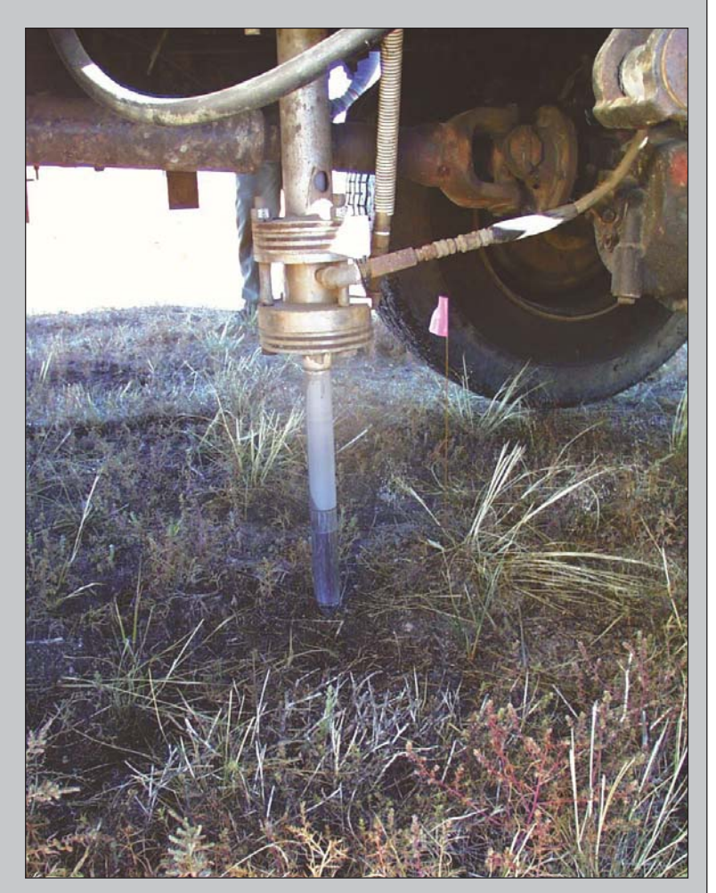
SCAPS probe collecting soil and groundwater data as it is pushed into the ground.

The first phase of subsurface investigation was to further characterize the mobility and volume of petroleum products underlying a portion of the former refinery. This investigation used an innovative technology developed by the U.S. Navy called the Site Characterization and Analysis Penetrometer System (SCAPS) to complete this characterization. The technology can identify petroleum products in soils and groundwater. Hydraulic equipment (brought in from San Diego, CA) pushes testing probes deep into the soil and groundwater to perform specialized tests and measurements. The probes can detect the presence or absence of petroleum and measures it's physical characteristics. The information gathered by the SCAPS equipment is then used to produce improved maps from which scientists develop models showing where hydrocarbon contamination exists at the site and how it behaves. Using the environmental data collected during earlier site investigations, in addition to that generated during the SCAPS investigation, ChevronTexaco will be able to evaluate the types and most effective locations for new remediation systems.