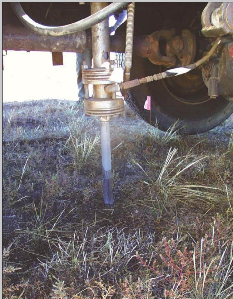
SCAPS probe collecting soil and groundwater data as it is pushed into the ground.

The first phase of subsurface investigation was to further characterize the mobility and volume of petroleum products underlying a portion of the former refinery. This investigation used an innovative technology developed by the U.S. Navy called the Site Characterization and Analysis Penetrometer System (SCAPS) to complete this characterization. The technology can identify petroleum products in soils and groundwater. Hydraulic equipment (brought in from San Diego, CA) pushes testing probes deep into the soil and groundwater to perform specialized tests and measurements. The probes can detect the presence or absence of petroleum and measures its physical characteristics. The information gathered by the SCAPS equipment is then used to produce improved maps from which scientists develop models showing where hydrocarbon contamination exists at the site and how it behaves. Using the environmental data collected during earlier site investigations, in addition to that generated during the SCAPS investigation, ChevronTexaco will be able to evaluate the types and most effective locations for new remediation systems.