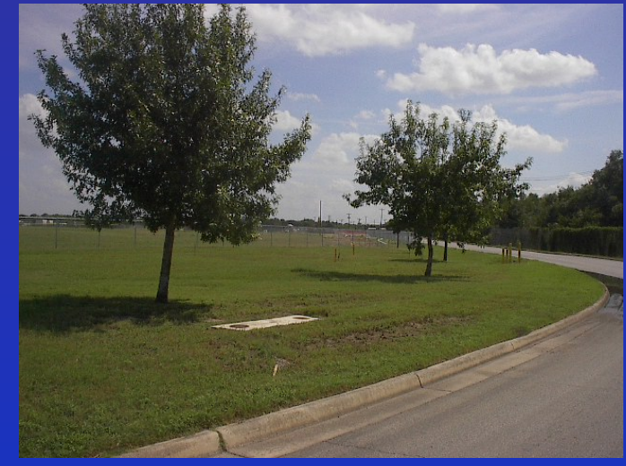
Adjacent to Citrus Road